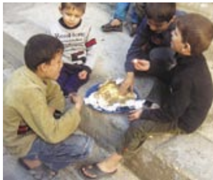
CWS partners were able to provide food relief during the attacks.

The effects of witnessing war and conflict, particularly the deaths of