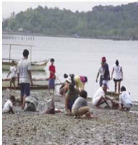
Community coastal clean ups are part of the environmental programme of Developers in the Philippines.

“The storms and waves eat away our beaches and as they continue they will someday eat us,” says Rev Baranite Kirata. People are moving inland, but it is not a sustainable solution. “If we don’t